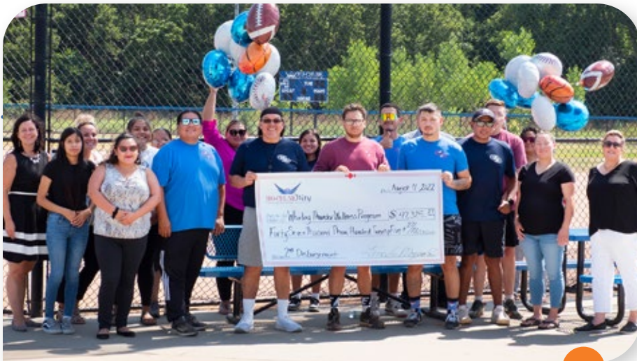
Ho-Chunk Way presenting a check to Whirling Thunder Wellness in Winnebago, Nebraska.

Most of Ho-Chunk, Inc.'s profit is driven by federal contracting. This revenue stream is essential to funding the company's programs, partnerships, and charitable donations in the Winnebago community. Because our business model is driven by the impact we can make on our community, we strive to give back to as many programs as possible, especially those that support the health, education and culture of the Winnebago Tribe.