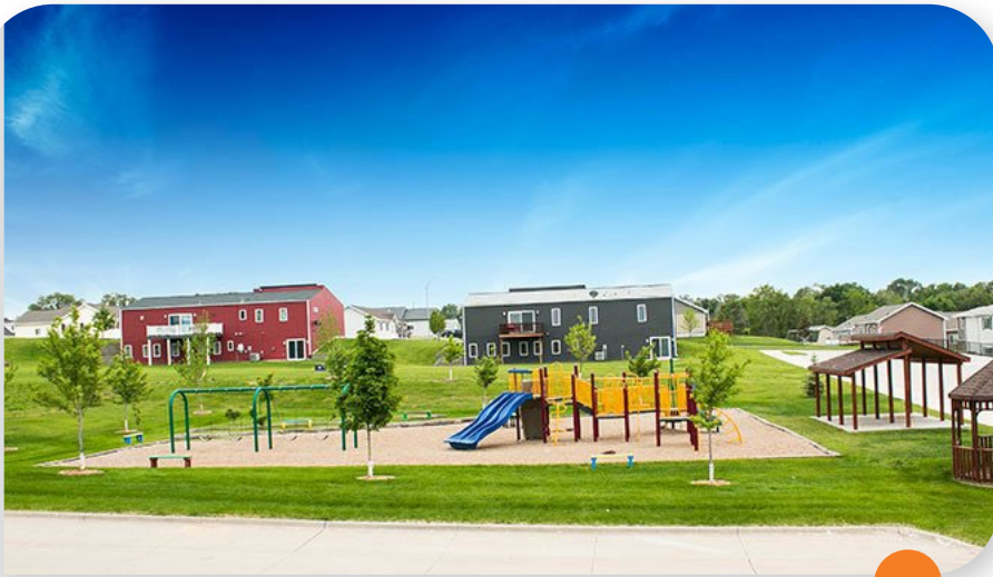
The original Ho-Chunk Village is a vibrant neighborhood within Winnebago. Now full, the company is expanding the community with Ho-Chunk Village 2.0.

Housing remains a critical priority in Winnebago, Nebraska. The Winnebago Tribe and Ho-Chunk, Inc. are helping more Tribal members realize the dream of home ownership and create generational wealth through community-wide programs and developments. Recent federal funds from the CARES Act and Indian Health Service have accelerated infrastructure development on a 40-acre expansion to the master-planned community that will create approximately 200 more living units. The $50 million Ho-Chunk Village 2.0 development includes 120 apartment units, 32 townhomes, 10 elder homes and 35 single-family homes.