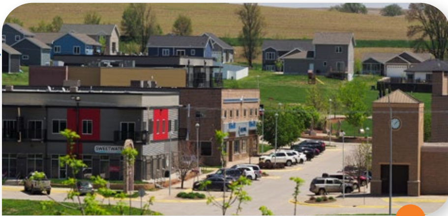
Ho-Chunk Village's bustling commercial areas contain a mix businesses and industries.

As Ho-Chunk, Inc.'s government contracting has grown, so has the company's economic impact – locally and across the tri-state region of Nebraska, Iowa and South Dakota. Ho-Chunk, Inc. is now a leading regional employer and prominent developer of real estate and other capital projects. This growth has contributed significant direct impacts, including labor income and state/local taxes, in addition to pass-through benefits from spending that ripple throughout the greater regional economy.